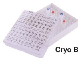
Cryo Box System - 100, PC