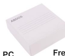
Freezing Cardboard Cryo Boxes, Cardboard

* Caution: Do not use Abdos Cryogenic vial in the liquid phase of liquid nitrogen. Improper use may cause liquefied nitrogen to be trapped inside the vial and lead to pressure built up resulting in possible explosion or biohazard release. Can be used in vapour phase of liquid nitrogen.